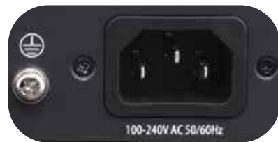
100-240V AC Power Input