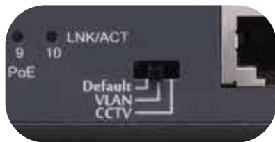
CCTV Mode Switch