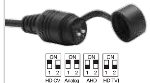
DIP Switch for Output Selection