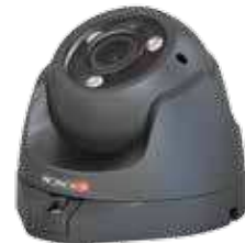
Available in Grey Color