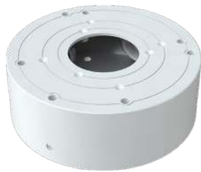
PR-JB12IP64 Small Junction Box