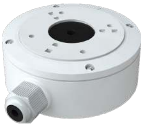
PR-JB12IP66 Small Water-proof Junction Box