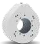
Junction Box (PR-B37JB) is available