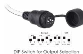
DIP Switch for Output Selection