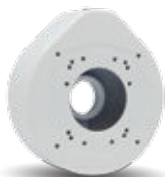
Junction Box (PR-B47JB) is available

Sensor: 1/3", 2 Mega-Pixel Selectable Output: 1080P AHD / CVI / TVI / Analog Lens: 2.8-12mm Mega-Pixel Vari-Focal True Day & Night – ICR IR Range: 35m (42 IR LED) IP66 CoC Support Weight: 836g Power: DC 12V, ~380mA