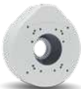
Junction Box (PR-B47JB) is available