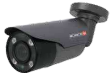
Available in Grey Color

Sensor: 1/3", 2 Mega-Pixel Selectable Output: 1080P AHD / CVI / TVI / Analog Lens: 2.8-12mm Mega-Pixel Vari-Focal True Day & Night – ICR IR Range: 40m (4 Array LED) IP66 CoC Support Weight: 836g Power: DC 12V, ~480mA