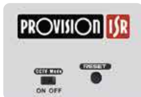
CCTV Mode + Reset Switch